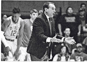
COACH K: Duke head coach Mike Krzyzewski reacts during the first half against Central Arkansas at Cameron Indoor Stadium in Durham, N.C., on Tuesday, Nov. 12. Duke won, 105-54.

"I've told my team this a number of times," Krzyzewski said last Friday night. "In the past couple of games, coaches have come in here and said how hard Duke plays, and those are great compliments, and that is our calling card. If you show up and don't play hard, that gives a lot of confidence to the other team - 'Oh, they're not who we thought they were' - so if we don't come out and match or exceed that effort, we're giving our opponent momentum right from the start."