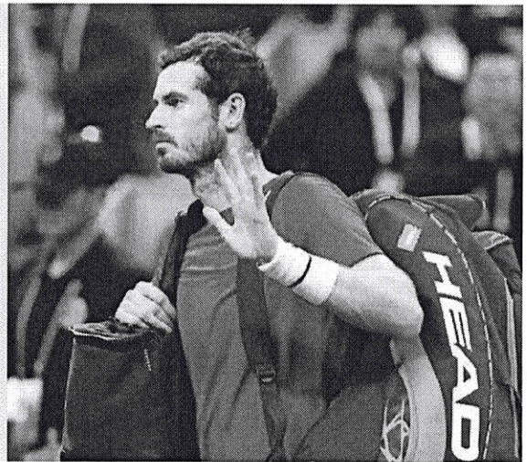
MURRAY WILLING TO TRY: Britain's Andy Murray reacts after the match against Dominic Thiem of Austria at the China Open men's quarterfinals Oct. 4 in Beijing, China.