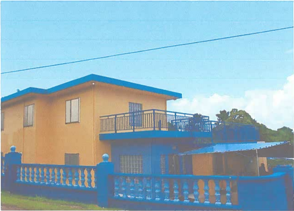
135 Manha Rd, Agana Heights, GU 96910

Single Family Property type 1998 Year built