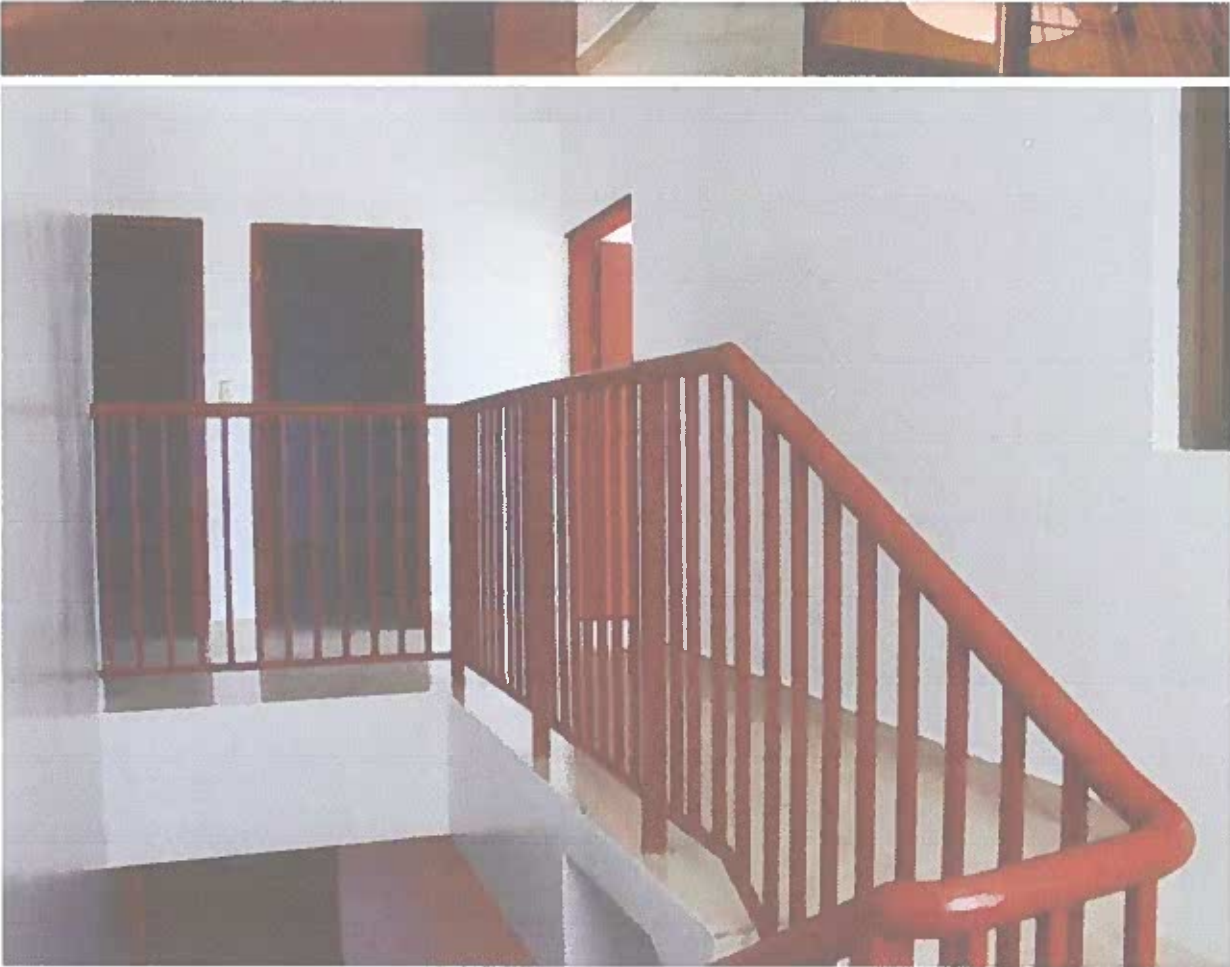
135 Manha Rd, Agana Heights, GU 96910

Single Family Property type 1998 Year built