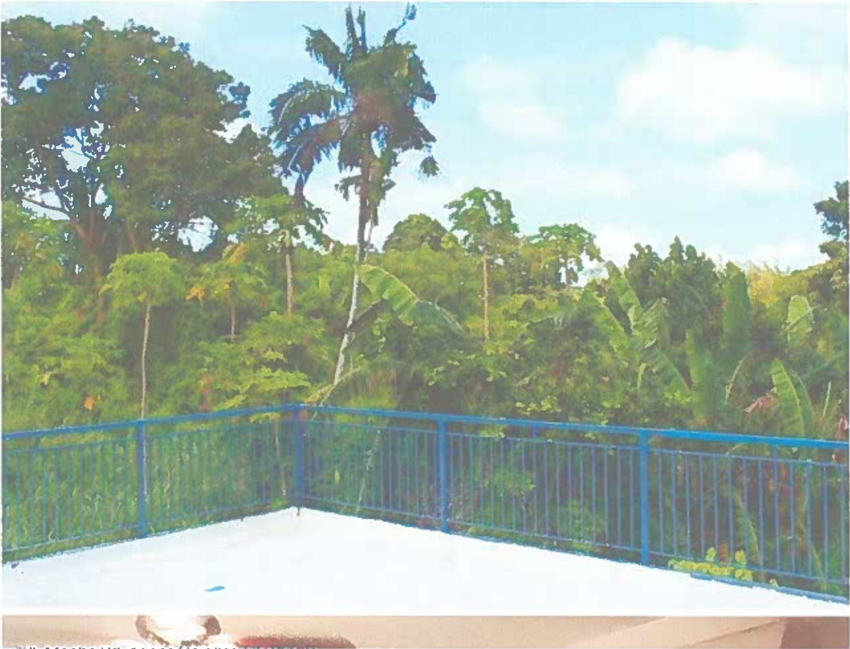
135 Manha Rd, Agana Heights, GU 96910